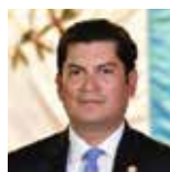
Guatemala Janio Rosales, Minister of Economy