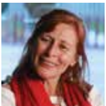
Mexico Tatiana Clouthier Carrillo, Secretary of Economy