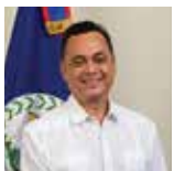
Belize Ramón Cervantes, Minister of State for the Ministry of Foreign Affairs, Foreign Trade, and Immigration