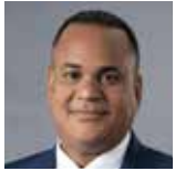
Bahamas Michael B. Halkitis, Minister of Economic Affairs