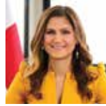
Panama Erika Mouynes, Minister of Foreign Affairs