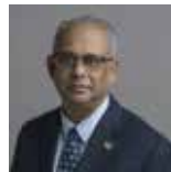
Suriname Albert Ramdin, Minister of Foreign Affairs, International Business and International Cooperation