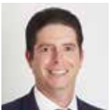
Panama Federico Alfaro, Minister of Commerce and Industry