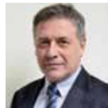
Uruguay Omar Paganini, Minister of Industry, Energy and Mining