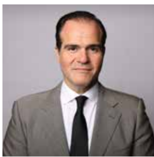
Mauricio Claver-Carone, President, Inter-American Development Bank