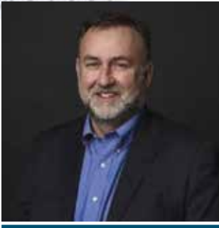
Benigno López, Vice President for Sectors and Knowledge, Inter-American Development Bank

Attorney at Law with a degree from the Catholic University of Asuncion Paraguay and a LLM from Georgetown University Washington DC USA. Ample experience in the public as well as in the private sector in areas involving Public and Administrative Law, Banking Law and International Law. General Counsel and Member of the Board of Directors of the Central Bank. He served as Senior Adviser to the Executive Director at the International Monetary Fund. From August 2013 to September 2014 served as Executive Legal Director of Itaipu a Binational entity in charge of providing energy to its owners Paraguay and Brazil. From September 2014 August 14, 2018 he served as President of Instituto of Prevision Social. He was appointed Minister of Finance of Paraguay on August 15, 2018. As of November 16, 2020 he was appointed as Vice President for Sector and Knowledge at the Interamerican Development Bank. He moved to Washington DC to serve at the IDB.