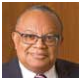
Barbados Jerome X. Walcott, Minister of Foreign Affairs and Foreign Trade