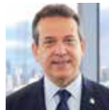
Dominican Republic Víctor Bisonó Haza, Minister of Industry, Commerce and MSMEs