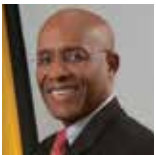
Jamaica Aubyn Hill, Minister of Industry, Investment and Commerce