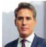
Costa Rica Manuel Tovar, Minister of Foreign Trade