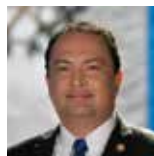
Guatemala Mario Adolfo Búcaro Flores, Minister of Foreign Affairs