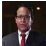
Peru Roberto Sánchez, Minister of Foreign Trade and Tourism