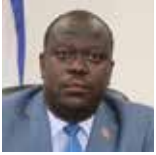
Haiti Ricardin Saint-Jean, Minister of Commerce and Industry