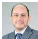
Ecuador Julio José Prado, Minister of Production, Foreign Trade, Investments and Fisheries