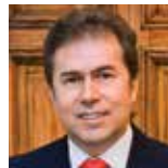
Paraguay Luis Alberto Castiglioni, Minister of Industry and Commerce