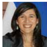
El Salvador María Luisa Hayem, Minister of Economy