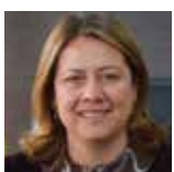
Colombia María Ximena Lombana, Minister of Commerce, Industry and Tourism