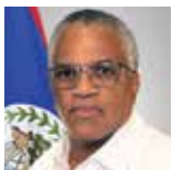
Belize Eamon Courtenay, Minister of Foreign Affairs, Foreign Trade, and Immigration